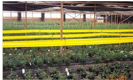
Sticky Yellow Ribbon Tape

The Sticky Yellow Ribbon Tape attracts the same insects as the traps; however, it can be used to encircle a growing area. The tap can also be applied along crop rows to trap flying insects on mass