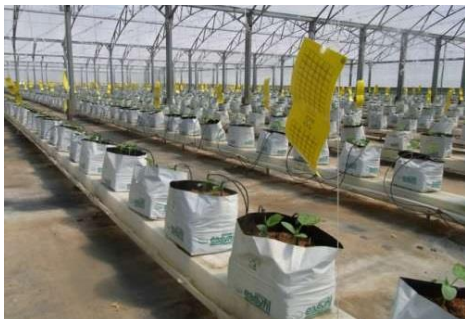
Sticky Yellow Traps in a Greenhouse

To use the trap, peel open and reverse fold, exposing the sticky yellow side. Hang trap with the twist tie provided