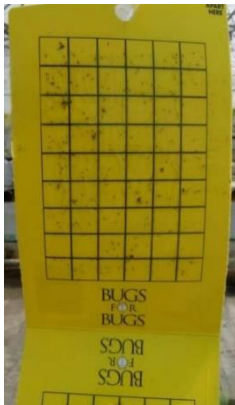
Sticky Yellow Trap

In order to assess pest populations for better integrated pest management systems, the Sticky Insect Traps are ideal. There are three types of trap: Yellow Sticky Traps, Yellow Sticky Ribbon Traps and Blue Sticky Traps. All three traps are long lasting and weather proof, providing accurate pest monitoring under a variety of conditions.